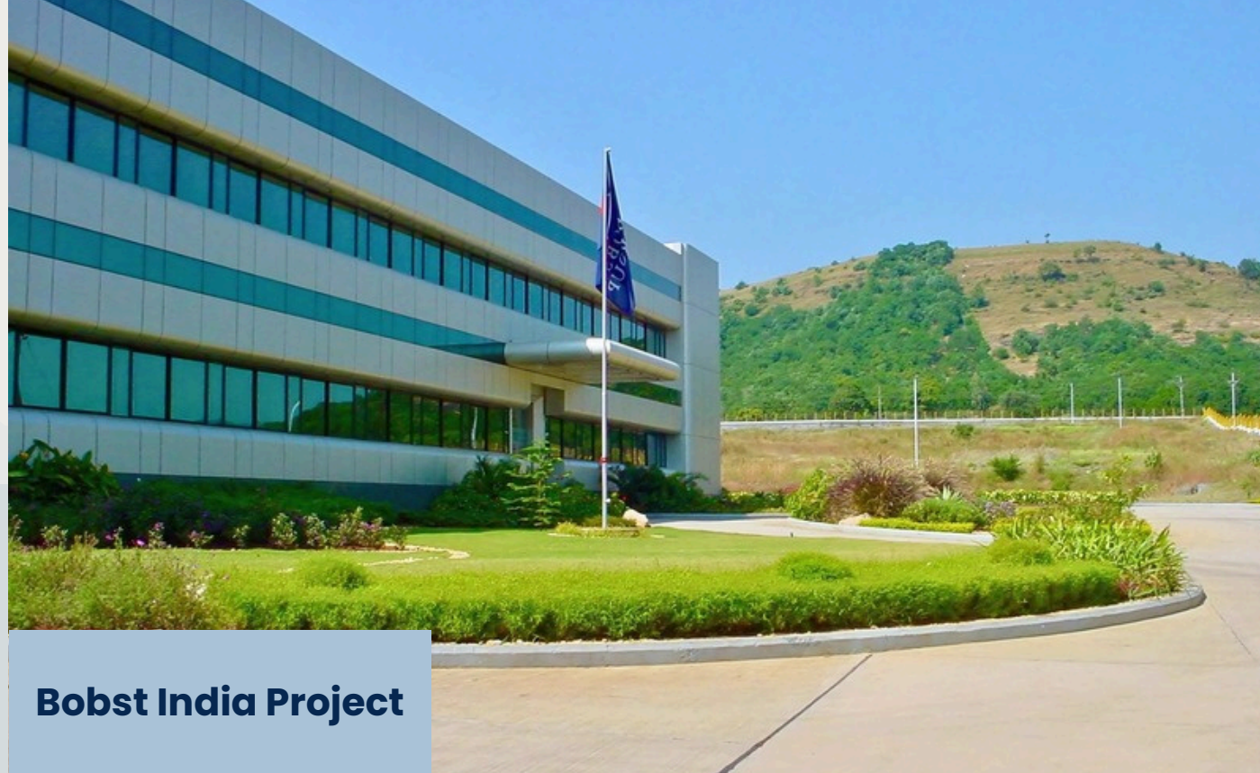
Bobst India Project